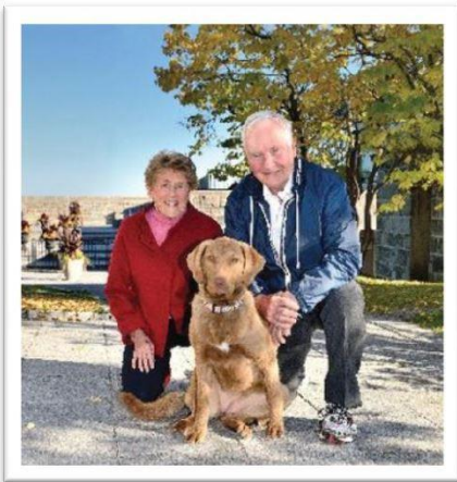
Dr David Johnston and Sharon Johnston

An Invitation from the Sunshine Women's PROBUS Club